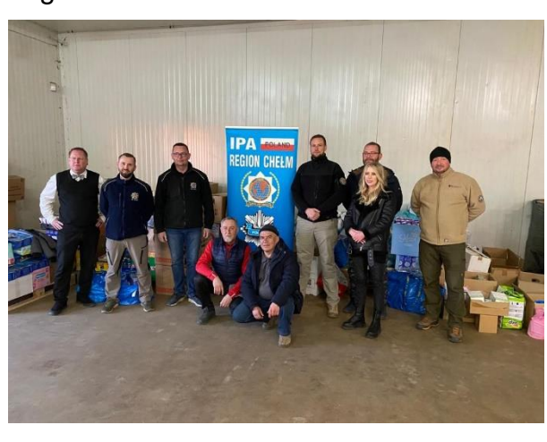
Handover to IPA Ukraine

I don't want to imagine what was going through people's minds as they got further and further from home minute by minute. Our journey led via Katowice to Dresden, and from there to Frankfurt.