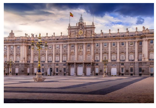
... as well as the capital Madrid!

In Toledo we will take a half-day guided tour to visit this monumental World Heritage city, the capital of the Spanish Empire under Carlos V. The visit to the medieval city of Avila will impress you, due to its magnificent city walls. We will also visit the National Police Academy (CNP).