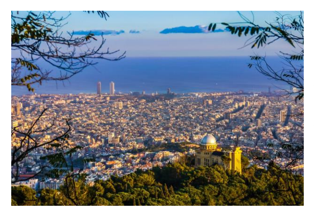
Look forward to visiting beautiful Barcelona ...

For those of you who want to take part in the Friendship Week after the World Congress, I assure you it will be amazing. Colleagues from IPA Madrid and the IPA Catalunya region have prepared a programme that you will not forget for years to come. You will be accompanied 24/7 by members of the organising committee.