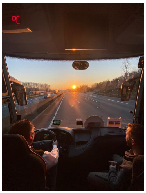
IPA on the move: Ukraine aid convoy eastward-bound

In order to provide the refugees with relief supplies, committed IPA friends became active and put together relief transports, which were initially financed by the German IPA Section and then became more and more extensive through a variety of donations.